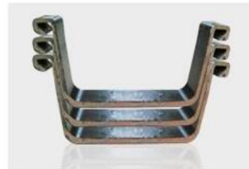
STEEL SHEET PILE