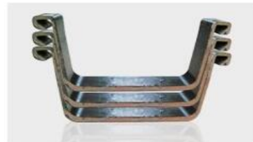
STEEL SHEET PILE